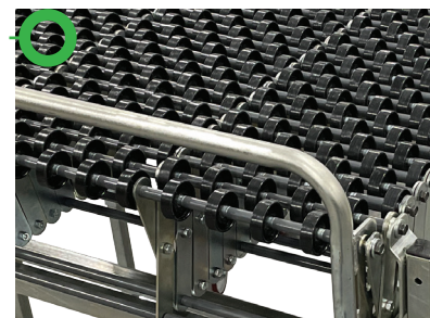
Polymer wheels available

Explore our complete portfolio, delve into detailed product information, and uncover specifications by visiting our website. www.ashlandconveyors.com