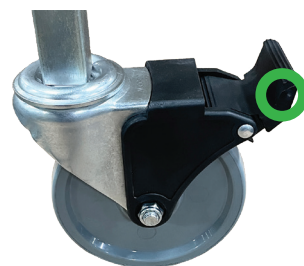
Combination braking and locking casters available