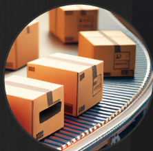
Post & Parcel

Elevate your material handling prowess with Ashland's Proflex Skatewheel Conveyor. Experience enhanced efficiency, durability, and adaptability designed for various industries. Connect with us and stay at the forefront of conveyor technology.