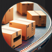
Post & Parcel

Elevate your material handling prowess with Ashland's ProSeries ProFlex Power. Encounter heightened efficiency, durability, and adaptability tailored to various industries. Connect with us to embark on a journey into the forefront of conveyor technology.