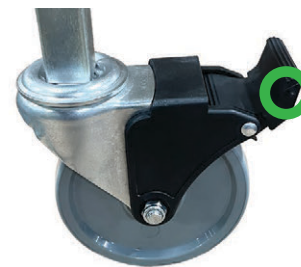
Combination braking and locking casters available