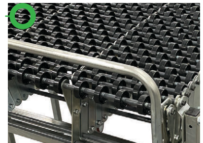
Polymer wheels available

Explore our complete portfolio, delve into detailed product information, and uncover specifications by visiting our website. www.ashlandconveyor.com